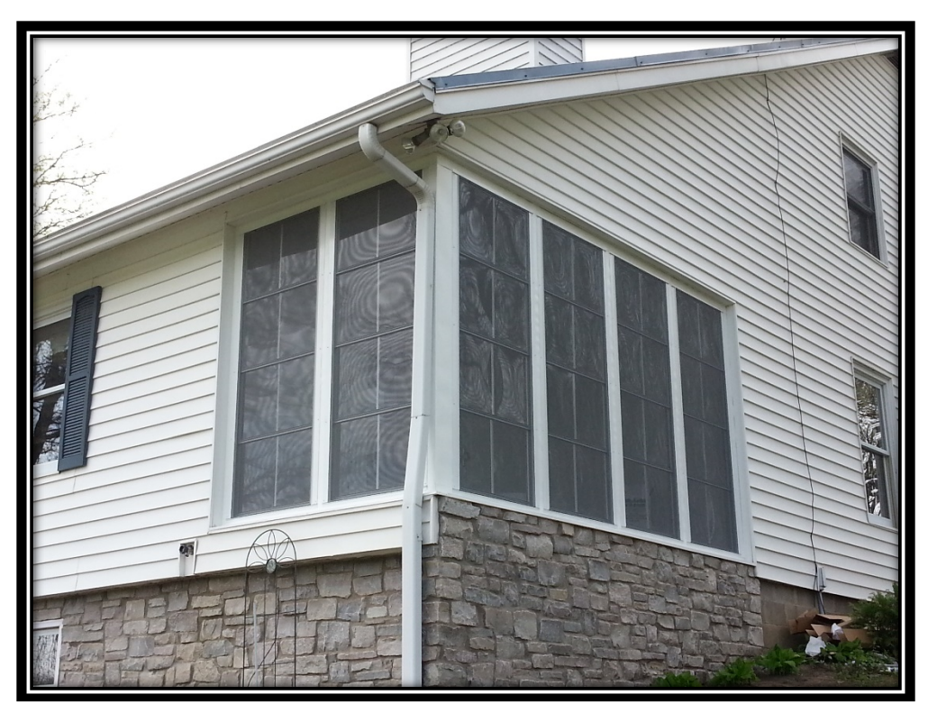
3 Season Porch