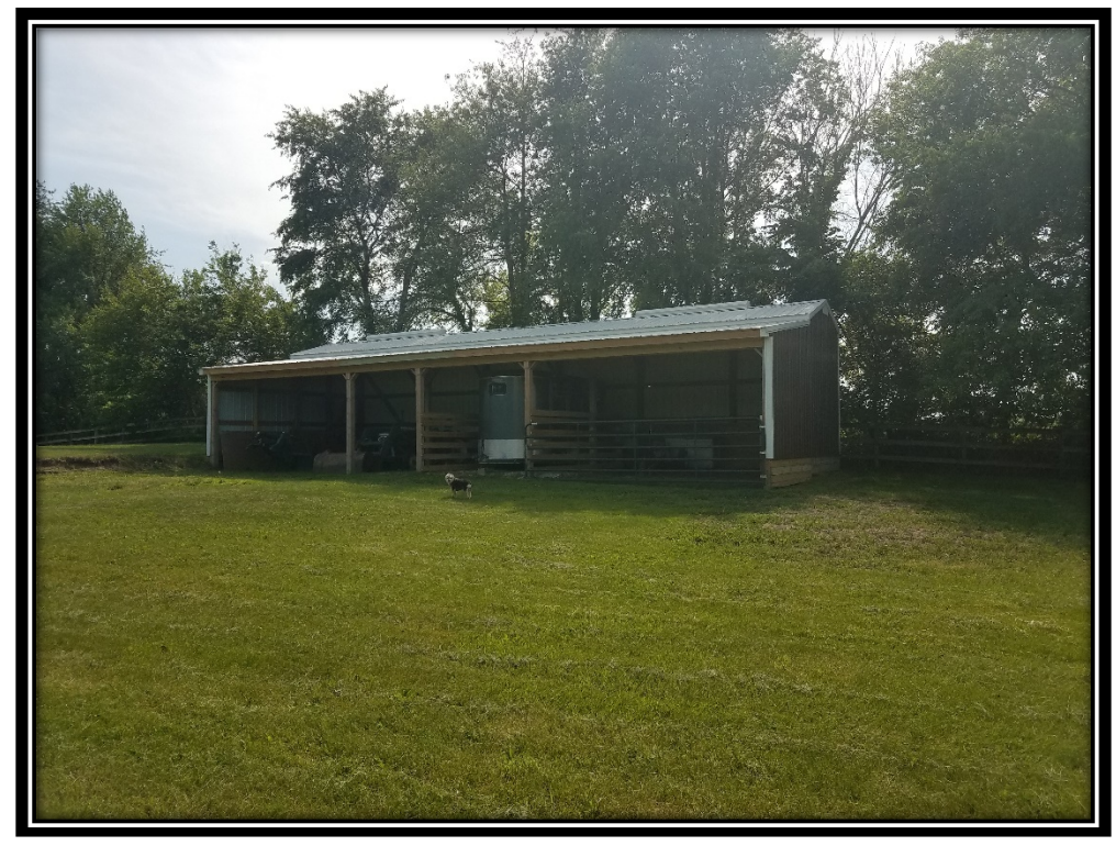
Open Front Shed